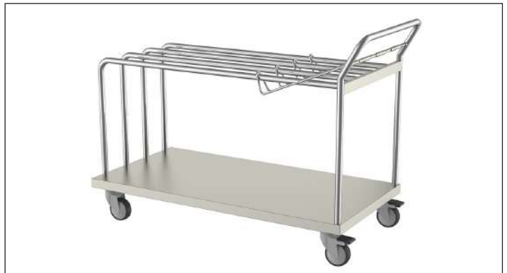
PAPER DISPENSING CART