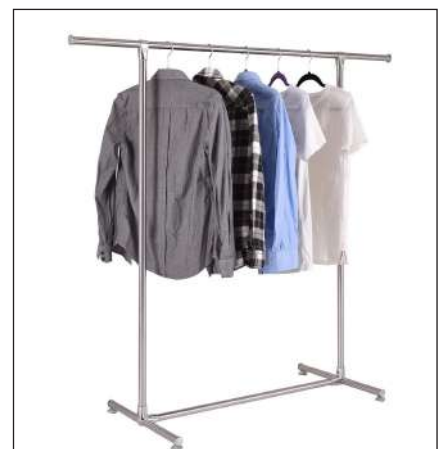
STAINLESS STEEL CLOTH STAND WITH WHEELS