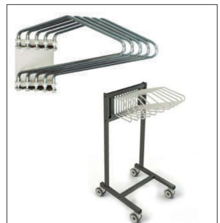
APRON HANGERS WALL MOUNTING AND FREE STANDING