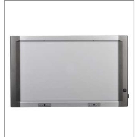
X-RAY FILM VIEWER