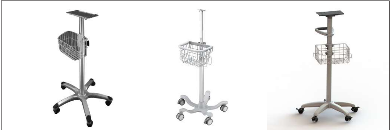
VARIETY OF MONITOR STANDS