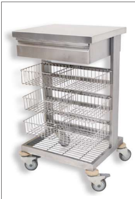
CRITICAL CARE CART- SS