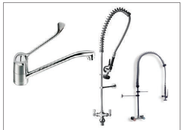
ELBOW OPERATED MIXER TAP AND HIGH PRESSURE MIXER RINSE DIFFERENT TYPES