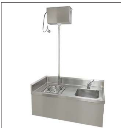
SLOPP HOPPER (SLUICE SINK)