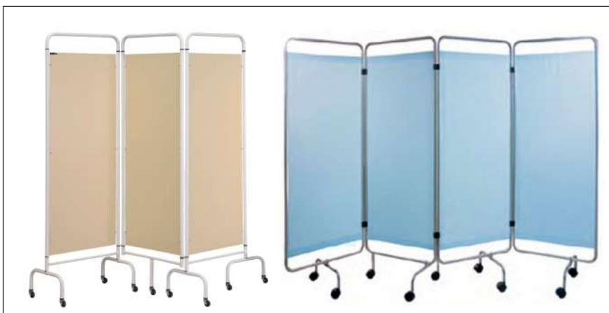
WARD SCREENS – TWO FOLD , THREE FOLD AND FOUR FOLD TYPES