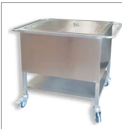
FILE TRANSPORT TROLLEY