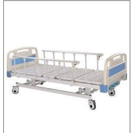
THREE WAY ELECTRICAL BED