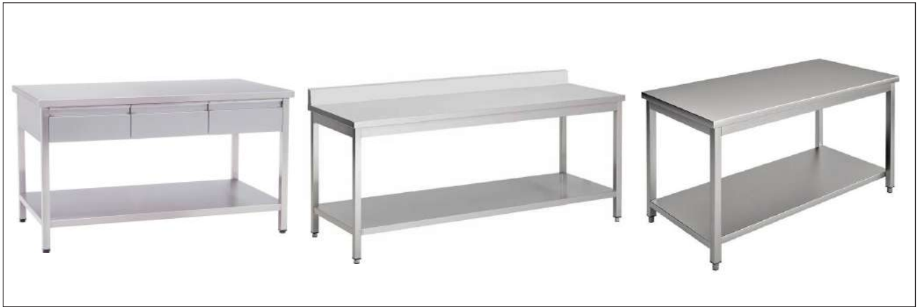
CUSTOMIZABLE WORK TABLES WITH AND WITHOUT UNDER SHELF, BACK AND SIDE SPLASH, WITH WHEELS AND INSPECTION LIGHTS