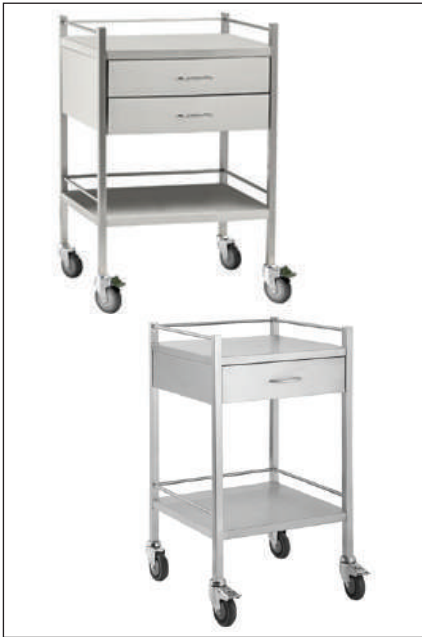
Model: 6600.11D & 21D