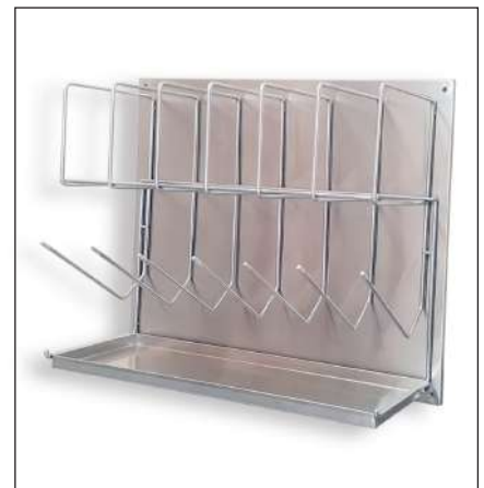
BED PAN URINAL HOLDER