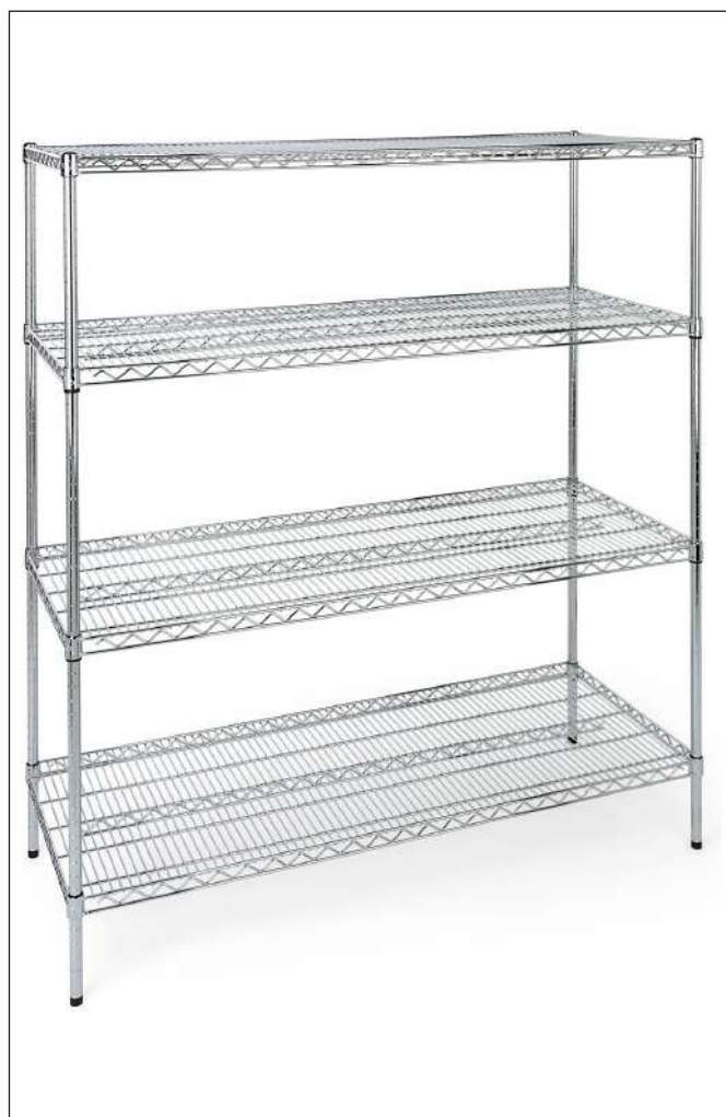
SHELVINGS – WIRE SHELVES, SOLID SHELVES