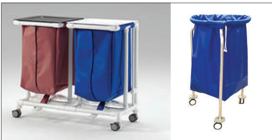
LAUNDRY TROLLEY WITH LID , SQUARE TYPE , ROUND TYPE