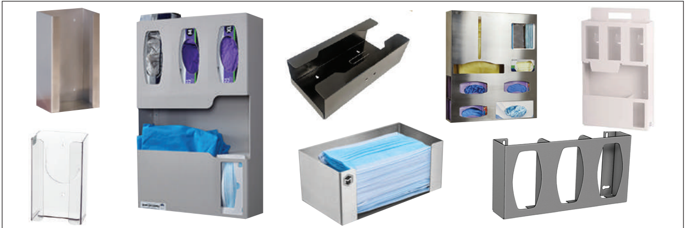
DIFFERENT TYPES OF PPE HOLDERS