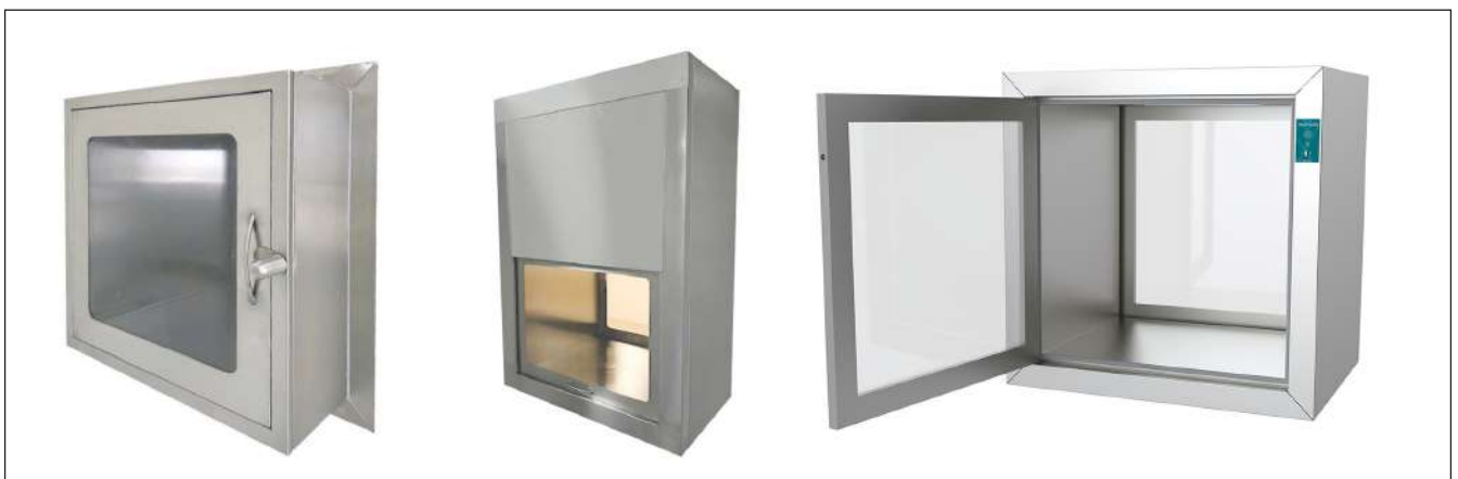
PASS THROUGH- ELECTRICAL AND MANUAL , HINGED DOOR TYPE, SLIDING UP AND DOWN TYPES- CUSTOMIZABLE SIZE