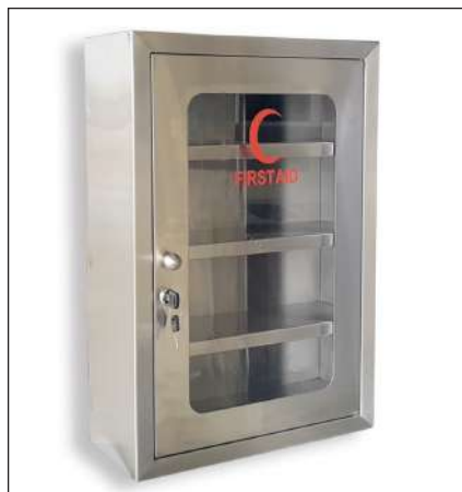
FIRST AID BOX