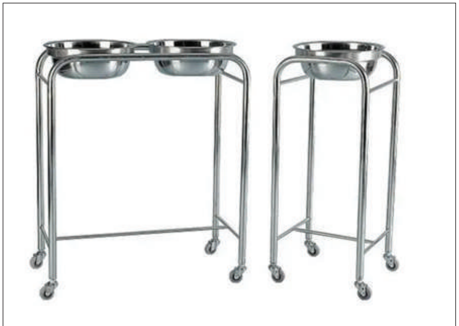
DOUBLE AND SINGLE BOWL STAND