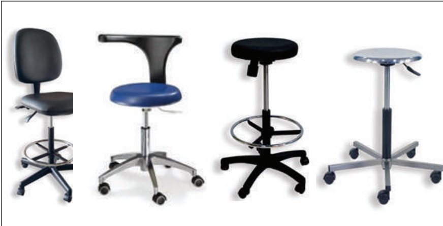
RS - LB