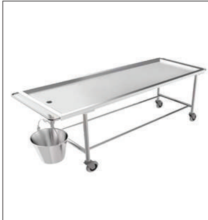
CADAVER CLEANING TROLLEY