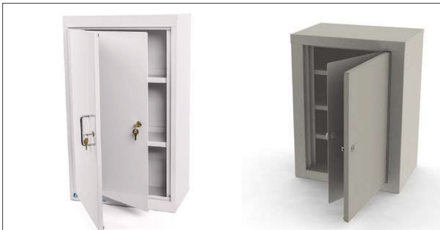
NARCOTIC CABINETS (SINGLE AND DOUBLE DOORS )

WALL MOUNTING , UPRIGHT CABINETS, STAINLESS STEEL, POWDER COATED, WITH ALARM, BUZZER AND DOUBLE LOCKS