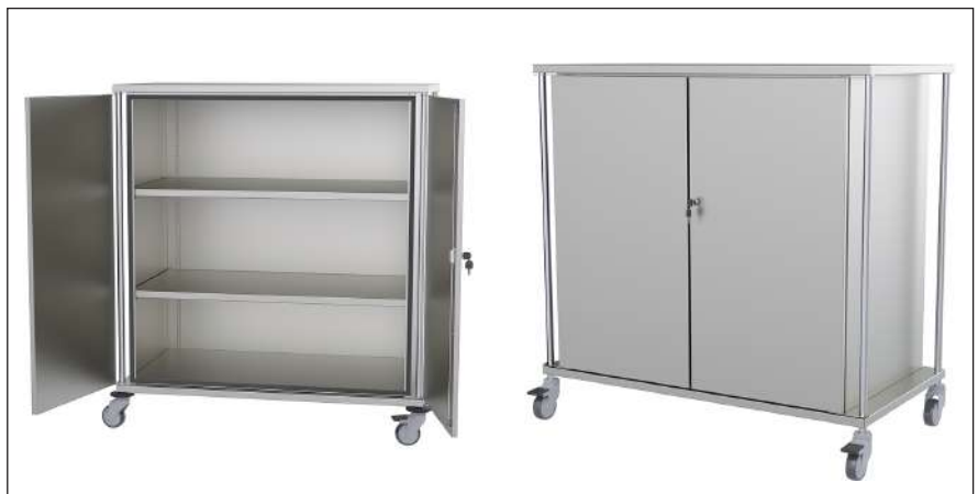
CSSD TROLLEY (SMALL AND BIG SIZE)