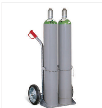
CYLINDER TRANSPORT TROLLEY