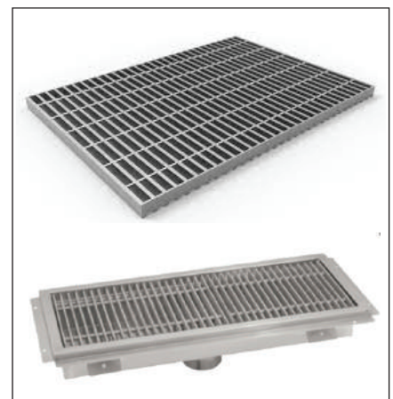
FLOOR GRATINGS - SS