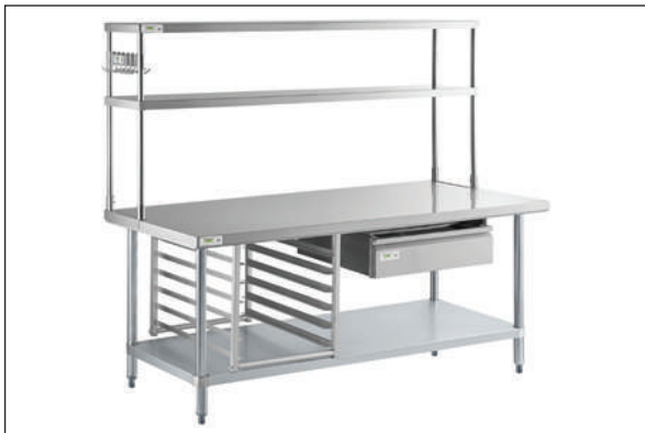
CUSTOMIZABLE PACKING TABLES