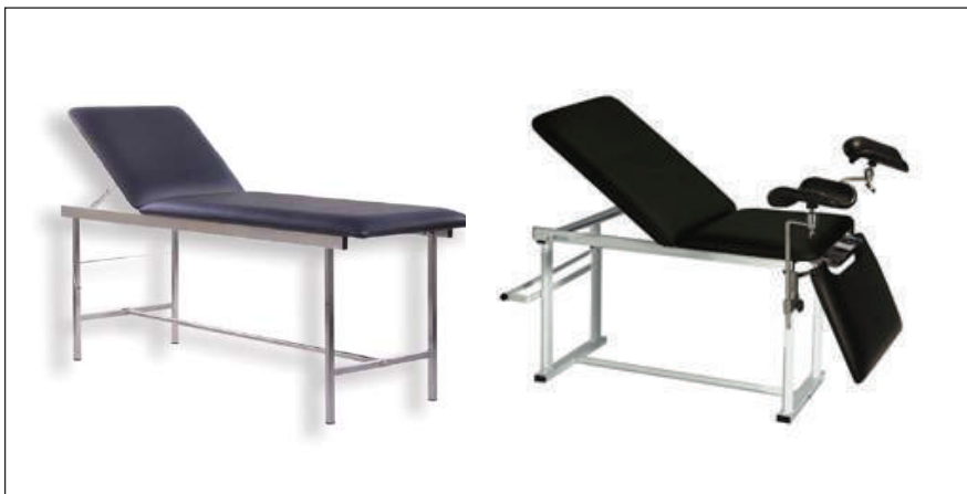
EXAMINATION & GYNECOLOGY COUCH