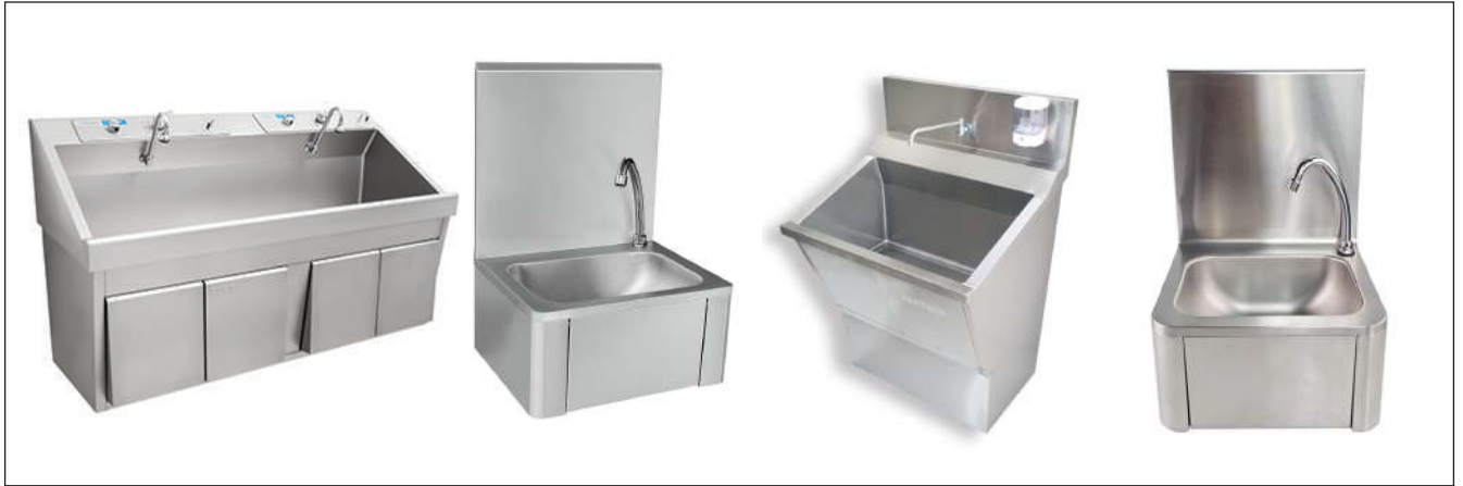
DOUBLE AND SINGLE STATION SCRUB SINKS