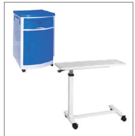
BEDSIDE CABINET AND BEDSIDE TABLE