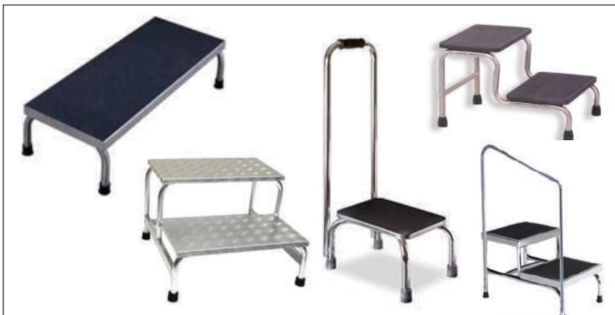
FOOT STEPS – SINGLE, DOUBLE AND TRIPLE MODELS WITH CUSTOMIZABLE HANDLES