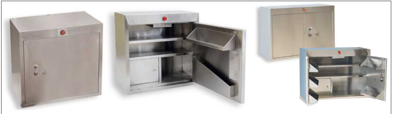
CUSTOM FABRICATED NARCOTIC CABINETS

WALL MOUNTING , UPRIGHT CABINETS, STAINLESS STEEL, POWDER COATED, WITH ALARM, BUZZER AND DOUBLE LOCKS