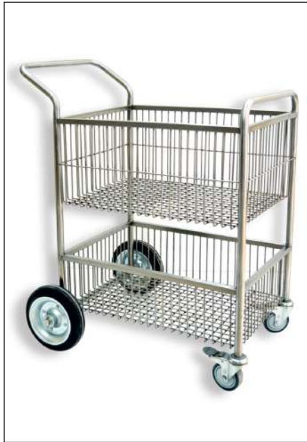
MULTI PURPOSE TROLLEY