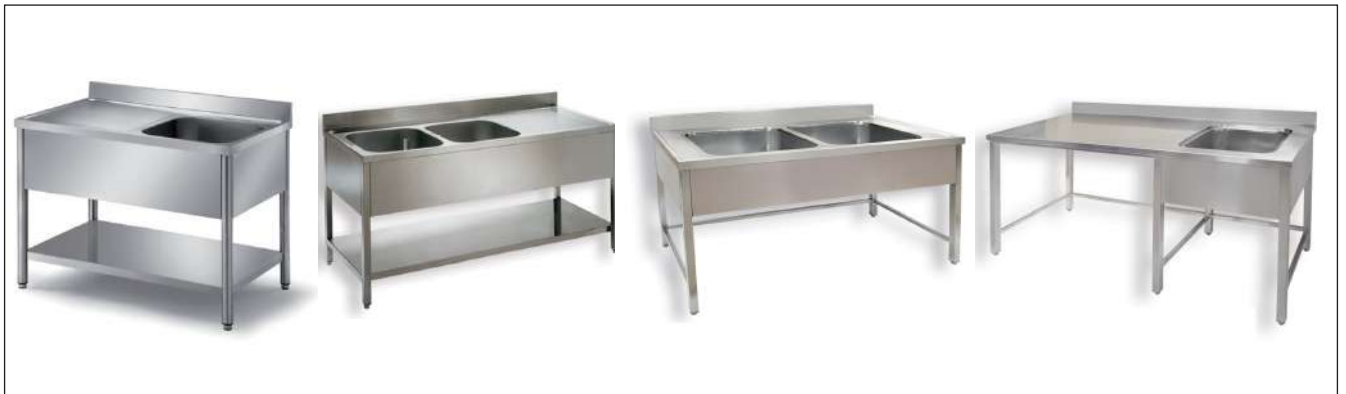
SINK TABLE – CUSTOMIZABLE