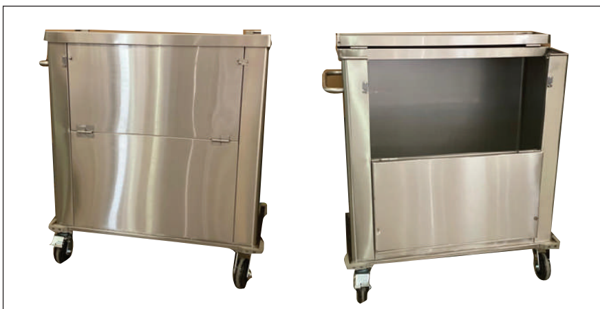
BOX SACKS LINEN CART