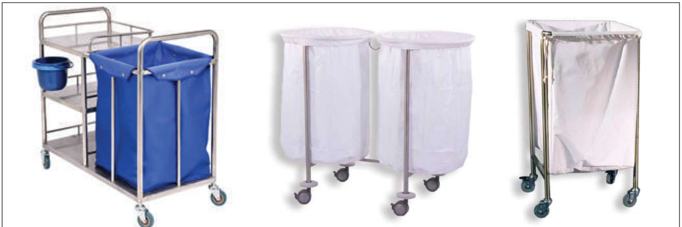
LAUNDRY TROLLEY WITH THREE SHELVES AND BUCKET & DIRTY LINEN TROLLEY