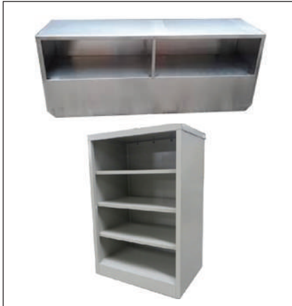
S BENCH & SHOE CABINETS