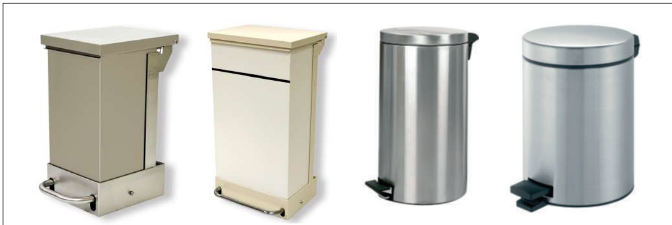
DUSTBINS – 20L, 30L, 40L 60L CUSTOMIZABLE