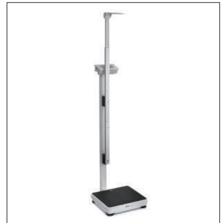
WEIGHING SCALE WITH HEIGHT CHECK