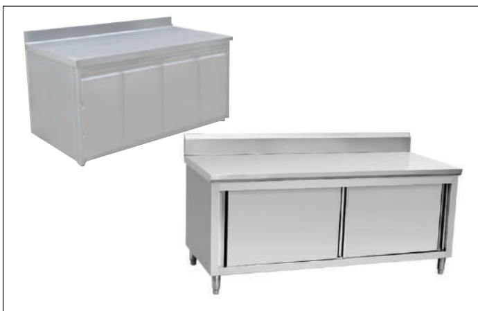
CUSTOMIZABLE BASE CABINETS