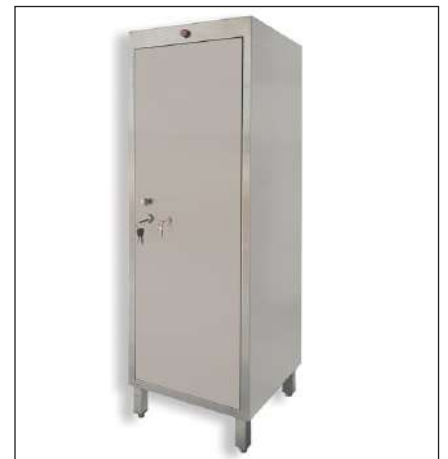
UPRIGHT NARCOTIC CABINET