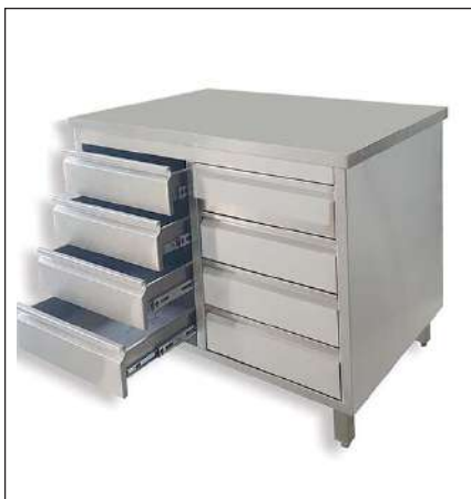
WORK TABLE WITH 8 DRAWERS