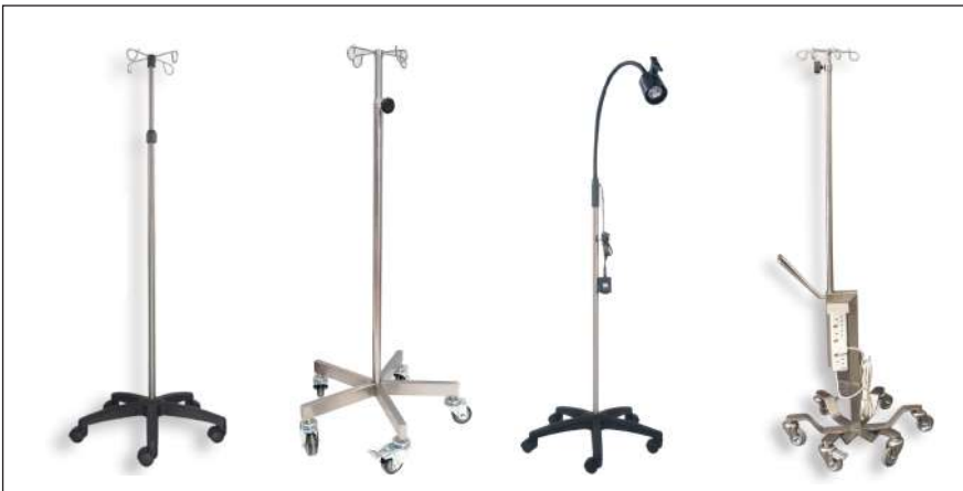
IV STANDS, EXAMINATION LIGHTS, SYRINGE PUMP STANDS